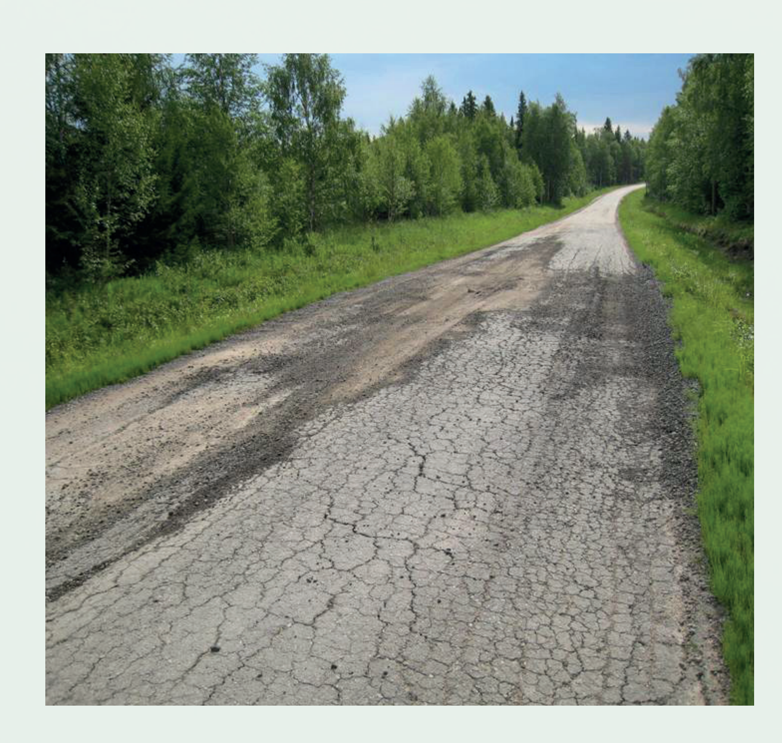
Lesson 1: Permanent Deformation

A suite of four web based elearning lessons based on ROADEX experience, designed to help learning in the workplace and in academic institutions