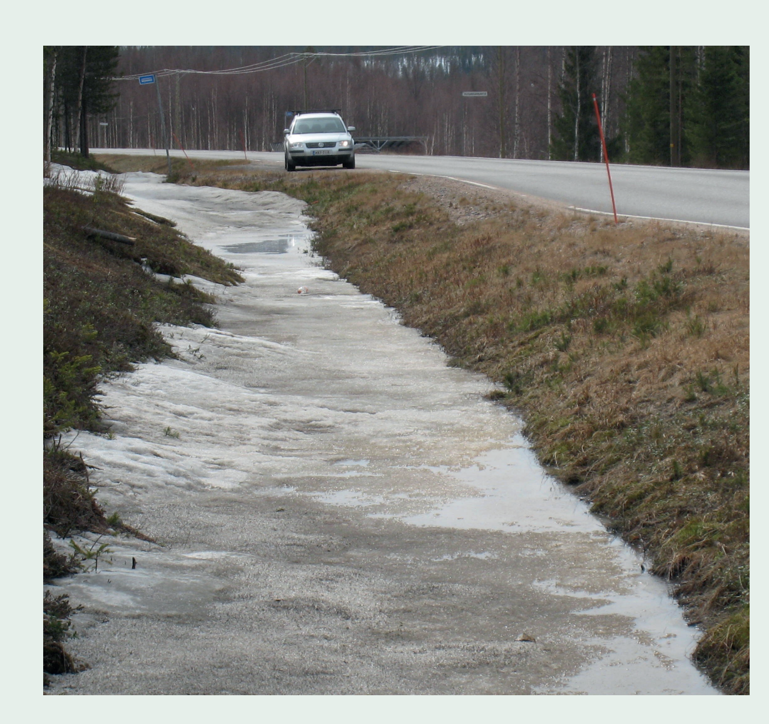
Lesson 3: Drainage of Roads

Shares technologies for the construction and maintenance of roads on peat from across the ROADEX area