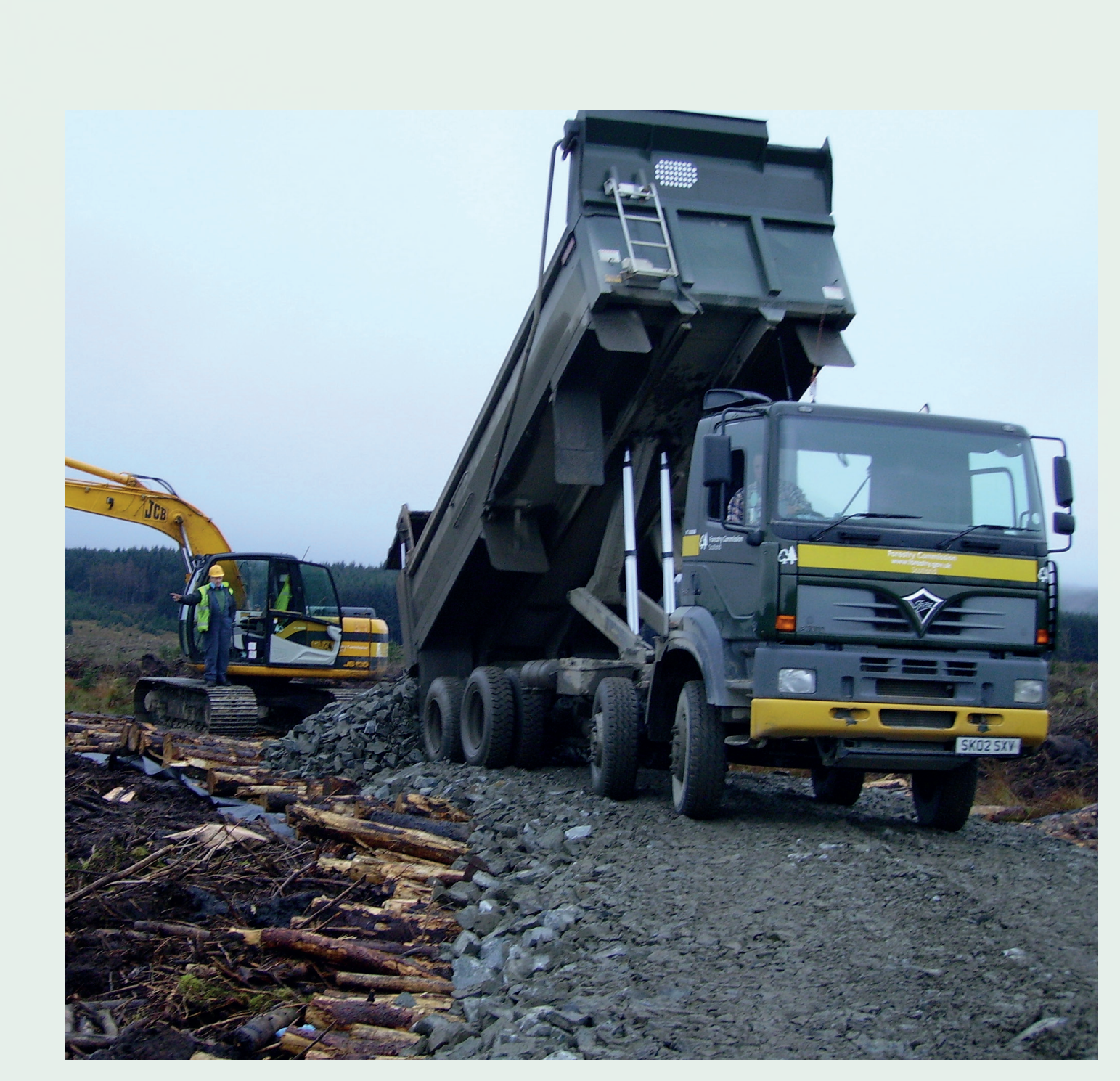
Lesson 2: Roads on Peat

Sets out best practice technologies for the design and management of low volume roads in harsh climates