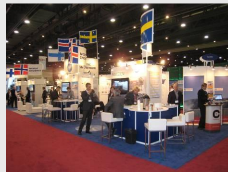
PIARC Winter Conference, Quebec