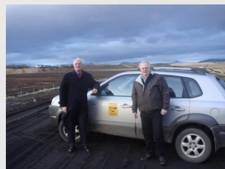
Reykjavik, January 2010