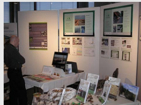
LAVA09 Conference, Reykjavik

You can find info on the web: www.roadex.org